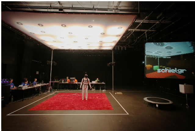
Figure 2: Moving in Minecraft, Foto: http://eSeL.at

independent movement of the view that is provided by the Oculus provides freedom, similar to looking out of a driving car. Observing a changing situation while scrolling, however, will eventually create the desire to change direction. With the position-based approach, this requires a step back onto the carpet, a move across the carpet, which leads to unintended local movement, and leaving the carpet for another scrolling direction. Instead, we found that relying on torso orientation, achieved better immersion. The user can turn inside the scrolling area, and changes scrolling direction in the virtual world. This is experience in way similar to, e.g., using roller skates and thus feels more natural. In essence, this allows the user to switch between something similar to normal pedestrian movement and floating.